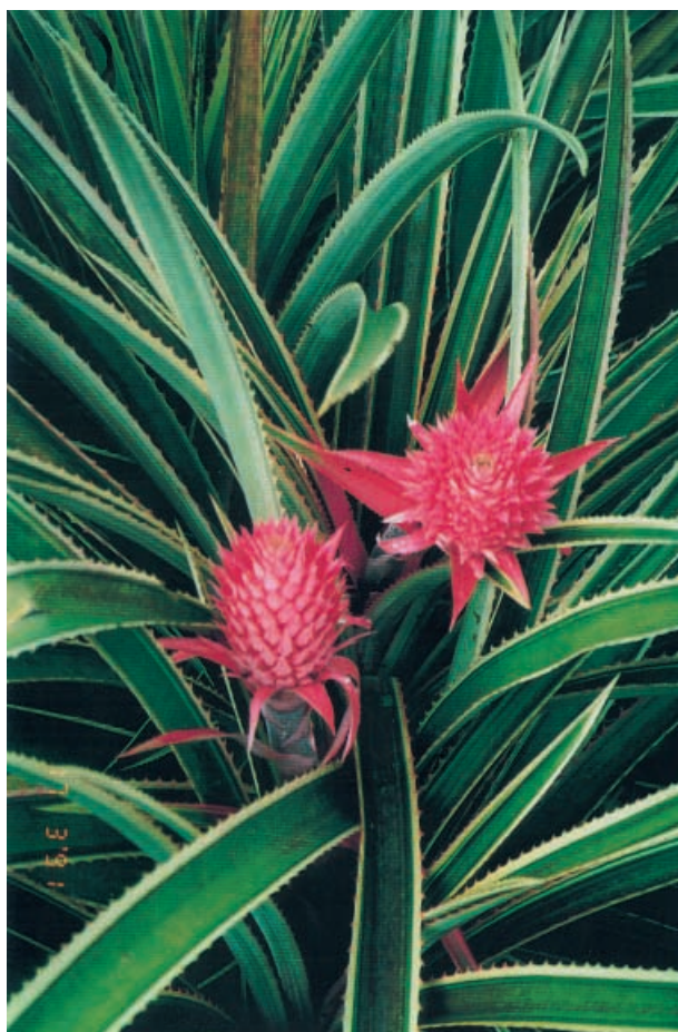
Figure 1. Young pineapple fruits between leaves suggested to secrete bromelain.

Bromelain BP (base powder), commercial crude extract; POS, BP given orally; F4, F9, Bromelain fractions.